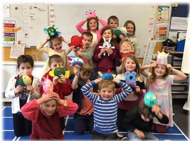
Olympic Mascots-from design to the final product