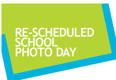
Photo envelopes will be sent home with students next week. Please return envelopes to school prior to photo day even if you are not ordering. Family envelopes are available from the office. Should you wish to have siblings photographed together (students enrolled at the school only) please contact the office so that a family envelope can be sent home with your child next week.