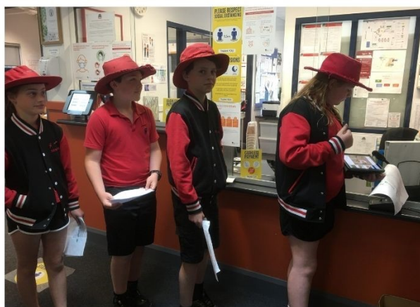
Photo envelopes were sent home with students last week. Please return envelopes to school prior to photo day (Friday 27th November) even if you are not ordering. Family envelopes are available from the office. Should you wish to have siblings photographed together (students enrolled at the school only) please contact the office so that a family envelope can be sent home with your child.