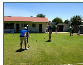
Play at Kyneton Croquet Club

The Kyneton Croquet Club will be holding free 'come and try' croquet games on Monday evenings in January from 6.00pm. commencing Monday, 4 th January. The Club is situated on the corner of Ebdon and Donnithorne Streets, Kyneton.