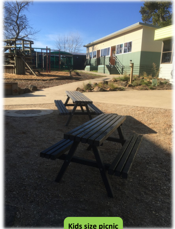
Kids size picnic tables